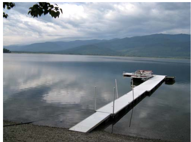
Swan Lake...what a beautiful view from the cabins

BHS Class of 1960 and BHS Class of 1965 had reunions this summer. If you would like to read more about their reunion weekends just go to the following websites: