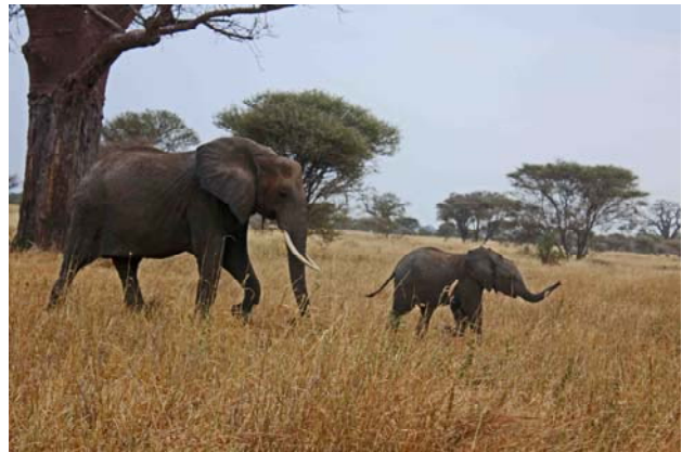
Female elephant & baby

We traveled the next ten days in close-sided 5 to 7 seat Land Cruisers with open hatch roofs for us to stand up and take photographs while observing the magnificent animals and birds. Morning and late afternoon game drives were taken in Tarangire National Park, Ngorongoro Crater and the sensational Serengeti National Park.