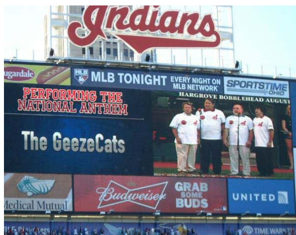
GeezeCats sang the National Anthem at a recent Indians Game.