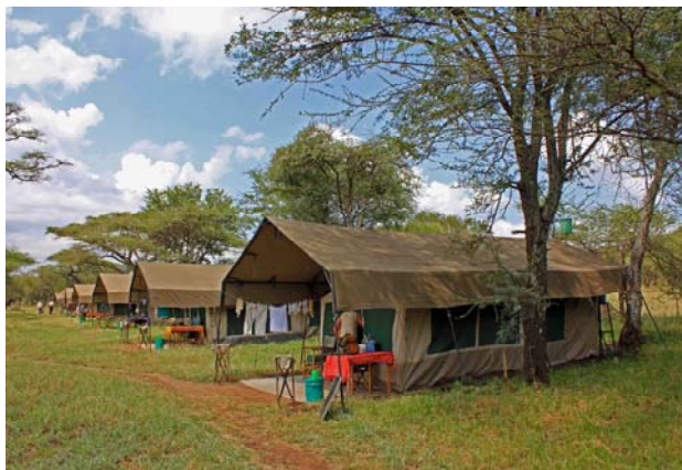
Serengeti Safari Tent

Our 14 day safari ended too soon and we no longer need to dream of someday going to Africa. Thanks for the memories, Africa! We will return.